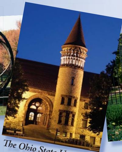
The Ohio State University