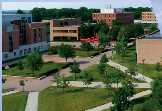
Wright State University