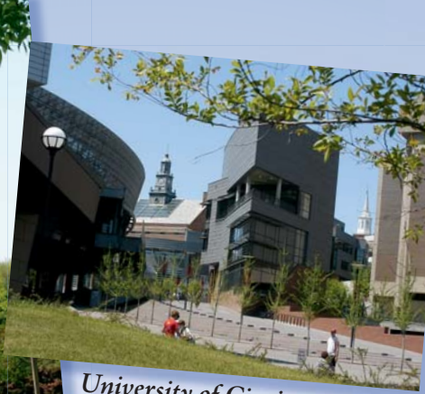
University of Cincinnati