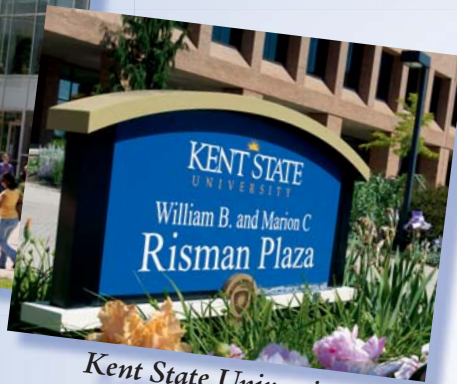
Kent State University