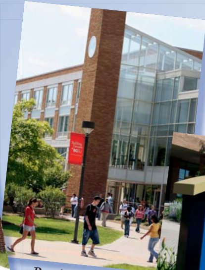
Bowling Green State University