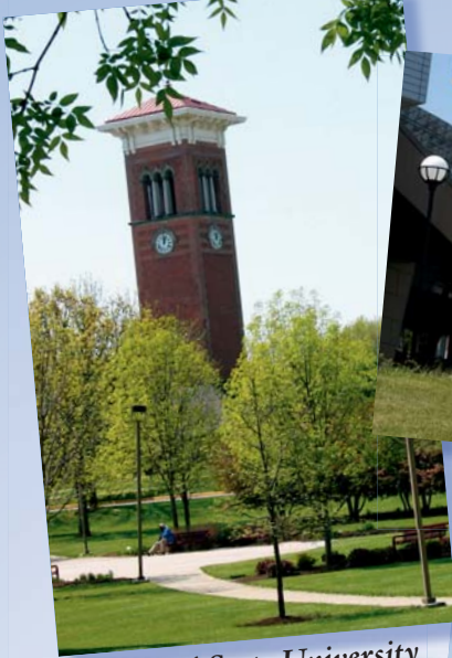
Central State University