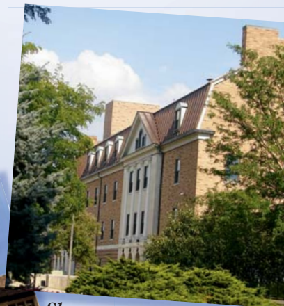
Shawnee State University