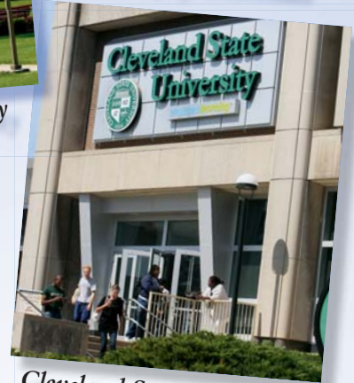
Cleveland State University