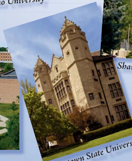
Youngstown State University