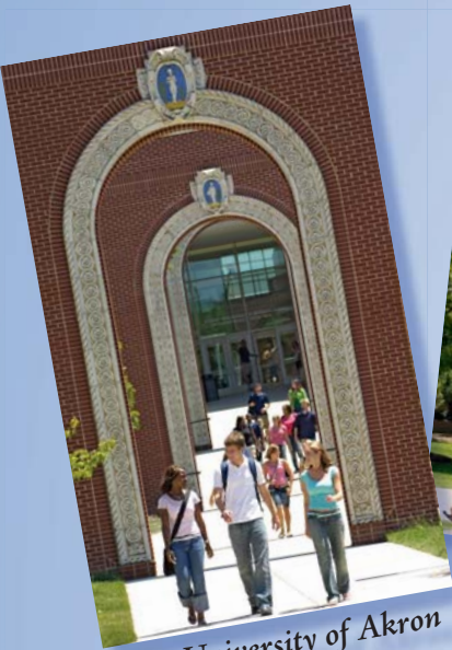
The University of Akron