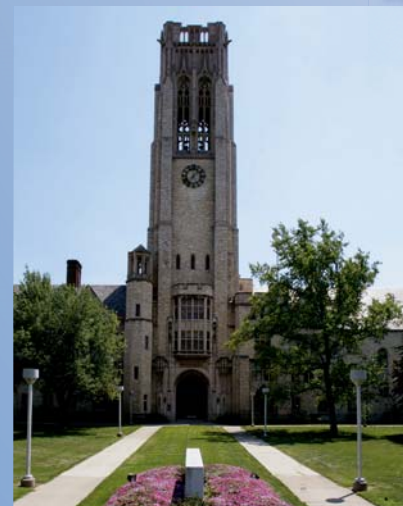
The University of Toledo